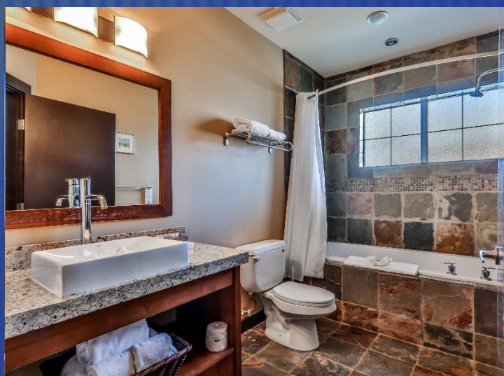
Relax & Restore In A Spa-Like Bathroom Setting