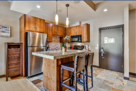
Fully Equipped Kitchen & Island With Eating Bar