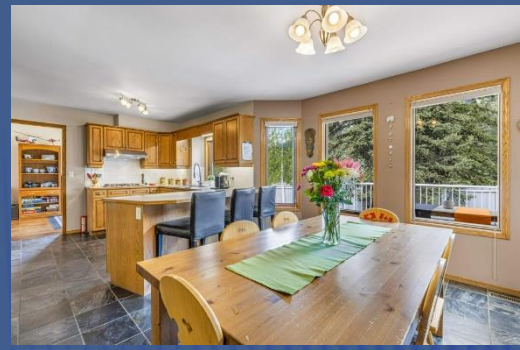
Dining – Lots Of Natural Light

This home makes great use of layout to provide an ideal family setting. You'll love watching the sun set from the front porch. A spacious livingroom provides a perfect gathering place in front of a wood burning fireplace. The adjoining den would be perfect for music, crafts or even a home office space. Picture yourself with friends enjoying wine and appys as you prepare the main course in your well laid out kitchen. The wrap-around deck allows you to move with the sun throughout the day. A private back yard provides an oasis for down time. Three bedrooms on the upper level allow everyone personal spaces to retreat and recharge. You'll soak in the view as you unwind in the jetted tub in the Master Ensuite. The lower level has a large recreation room, a fourth bedroom for guests and 4pc bath. The double car garage allow lots of room for your gear. Located on the sunny side of the valley you are minutes from downtown shops , restaurants and trails as well as close to schools. Whether yours is a growing family, teens, or looking forward to grandchildren visiting you will find this home checks all the boxes. Take a virtual tour then book your private viewing. Contact your Associate today. We think you'll agree that layout, location and flexibility all add up to a great value.