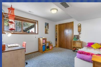
Lower Level Fourth Bedroom