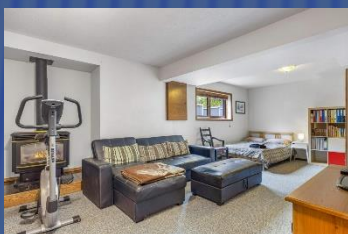
Lower Level Rec. Room