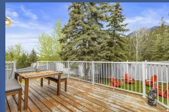
Rear Deck + Private Yard