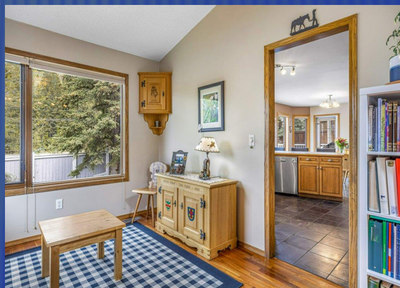
Spacious Gathering Livingroom + Den