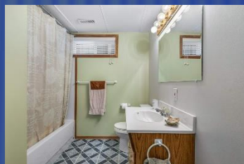
4pc. Lower Level Bath