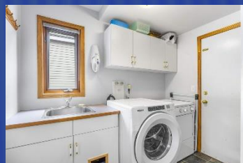
Laundry + Mud Room