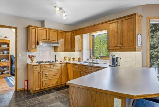
Kitchen With Lots Of Counter & Cabinet Space Plus Eating Bar