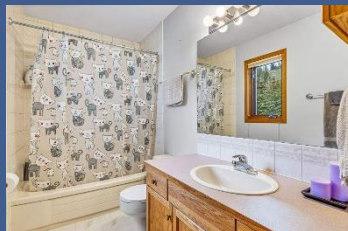
4pc Main Bath