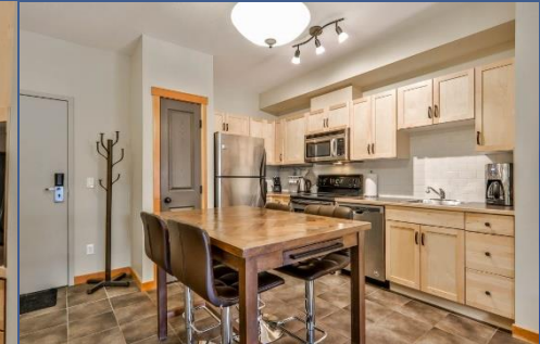
Owner's Lockable Pantry

This fully equipped and furnished one bedroom, one bath unit at the Lodges at Canmore (one of Canmore's best run condo corporations) is ideally located within easy walking distance of trails, restaurants, shops and downtown. You'll love the onsite amenities such as the outdoor heated pool, fitness center, three hot tubs and outdoor decks. After a day outdoors you'll love coming back to your unit which comes turn-key ready for use an ideal mountain getaway. The open concept main living area provides a nice gathering space. The generously sized deck is a great place to watch the sun setting on the mountains. When not using it personally, rent it out either through the managed rental program or self manage through AirBnb, VRBO, etc and earn good returns while building long term value outside of the gyrations of other investment options. Take a virtual walkthrough then book your private viewing today. There is still time to capture the busy Fall season bookings!