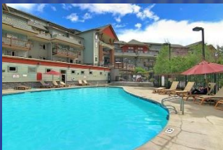
Pool Open Year Round

Property Tax (2020)= $3,934.39 Condo Fee (2020) = $406.60/mth