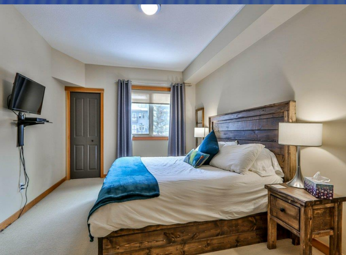
Spacious Master Bedroom