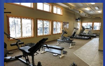
Well Equipped Fitness Center