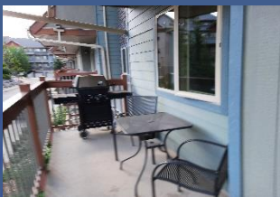
Spacious Covered Deck