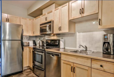
Lots of Cabinet Space