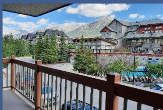
Mountain View From Deck