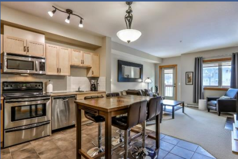
Well Laid Out Kitchen