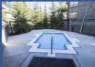
One Of Three Hottubs