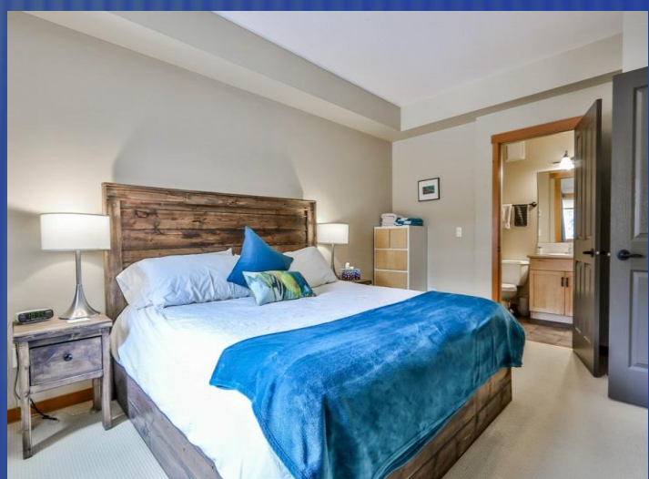
Bedroom With Access To Bath