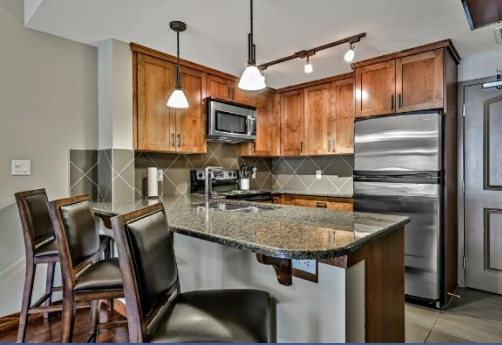
Fully Equipped Kitchen For Your Needs Including Eating Bar