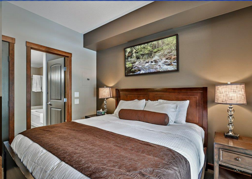
Master Bedroom With Adjoining 5pc Bathroom