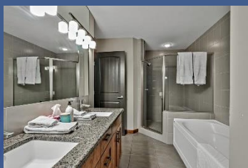
Very Spacious 5pc Bath