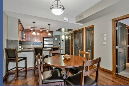
Separate Dining Area

You'll love this quiet unit ideally located with easy access to the pool and hottub. Stylishly laid out with tiled entry, wood flooring, granite countertops and rundle rock around the fireplace this fully furnished and equipped 1BR is tastefully decorated and features stainless steel appliances, king sized bed and soaker tub perfect for unwinding after a day outdoors. Extra storage allows room for gear. Enjoy entertaining on your private deck or relaxing with a book. Live, work, enjoy and when not using personally rent the unit through Airbnb and earn good revenue. This unit is a perfect blend of luxury, design and space. Take a virtual tour then book your private viewing. We think you will agree this unit checks all the boxes.