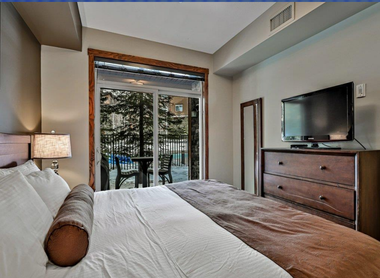
Master Bedroom With Access To Patio