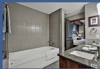
Relax In Soaker Tub