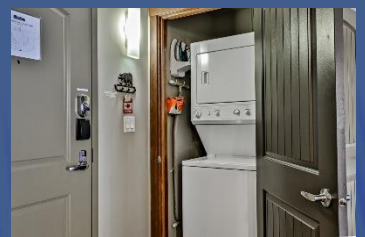
Full Sized In-Suite Laundry