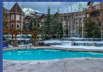
Outdoor Pool + Hottub