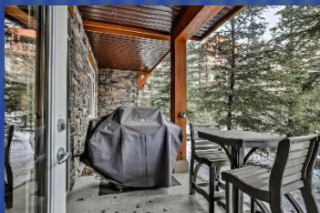
Spacious Private Deck

Property Tax (2020) = $3913.46 Condo Fees (mth) = $ 580.05